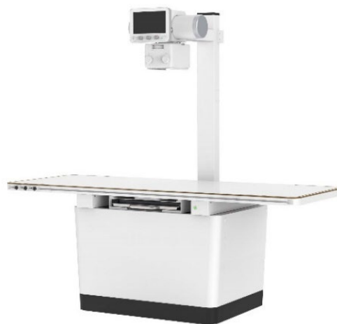
Production units will have different accent color placement than pictured. No performance specifications are affected.

Techniques can also be customized and saved by the veterinary staff as needed.