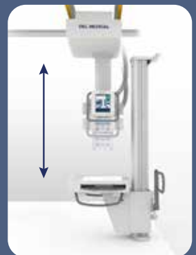
► SID track to wall stand