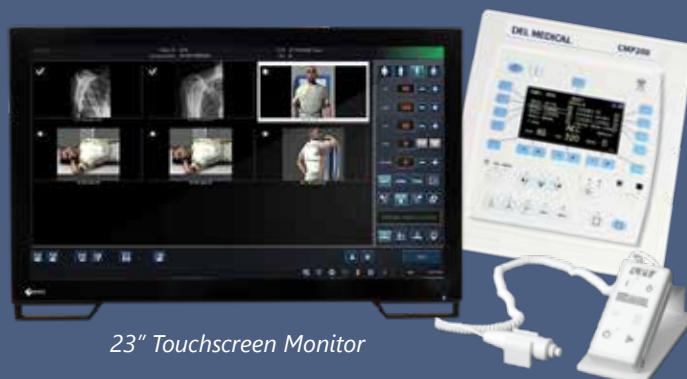
23" Touchscreen Monitor

The OTC18T System is powered by a compact and robust CMDR generator, available in 50, 65 and 80 kW models. The generator is fully integrated with the DelWorks DR Workstation creating a streamlined workflow and enhancing dose efficiency.