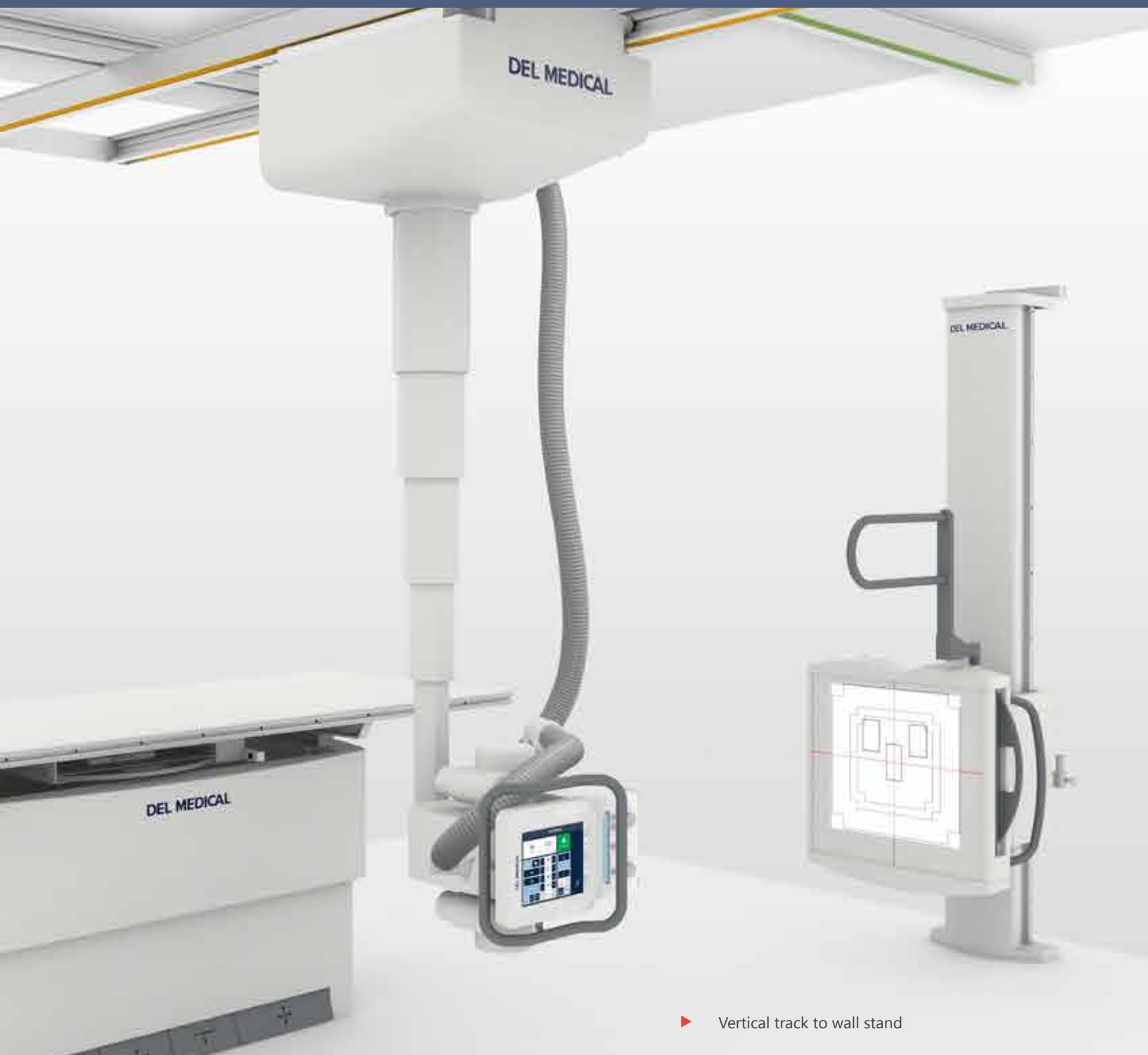
► Vertical track to wall stand