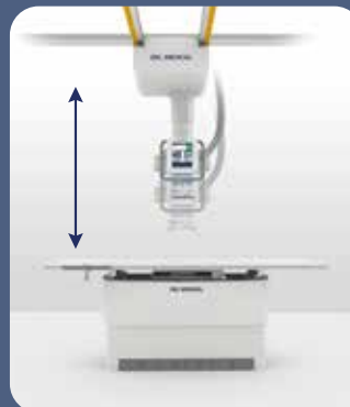
► SID track to table

Synchronized motorized movement of the tube crane's vertical axis maintains precise centering between the X-ray tube and image receptor. Available functions include vertical tracking to the wall stand, SID tracking to the elevating table, or horizontally positioned wall stand. The result is quick, accurate alignment without the extra time and effort needed to make additional manual adjustments.