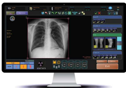
State-of-the-art imaging software supports detailed bone and soft tissue visualization.

The mKDR™ Digital Radiography System brings advanced digital X-ray capabilities anywhere in the hospital.