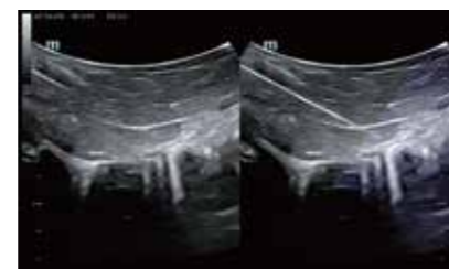
iNeedle + on convex