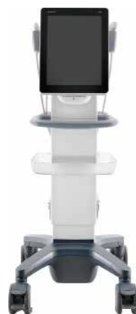
Simple | Focused | Smart

Touch Screen Ultrasound System Simple | Focused | Smart