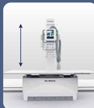
▶ SID track to table

Synchronized motorized movement of the tube stand's vertical axis maintains precise centering between the X-ray tube and image receptor. Available functions include vertical tracking to the wall stand and SID tracking to the elevating table. The result is quick, accurate alignment without the extra time and effort needed to make additional manual adjustments.