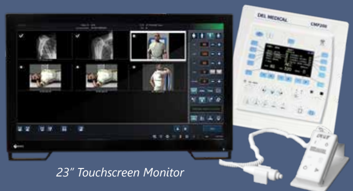
23" Touchscreen Monitor

The FMT18T System is powered by a compact and robust CM Series generator, available in 32, 40, 50, 65 and 80 kW models. The generator is fully integrated with the DelWorks DR Workstation creating a streamlined workflow and enhancing dose efficiency.