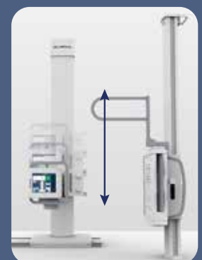
▶ Vertical track to wall stand